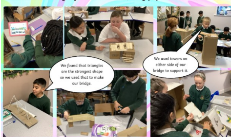
After much research on bridge styles and strengths, Year 5 designed and made bridges from cardboard, lolly pop sticks and straws.