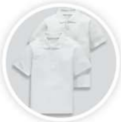
White polo shirt