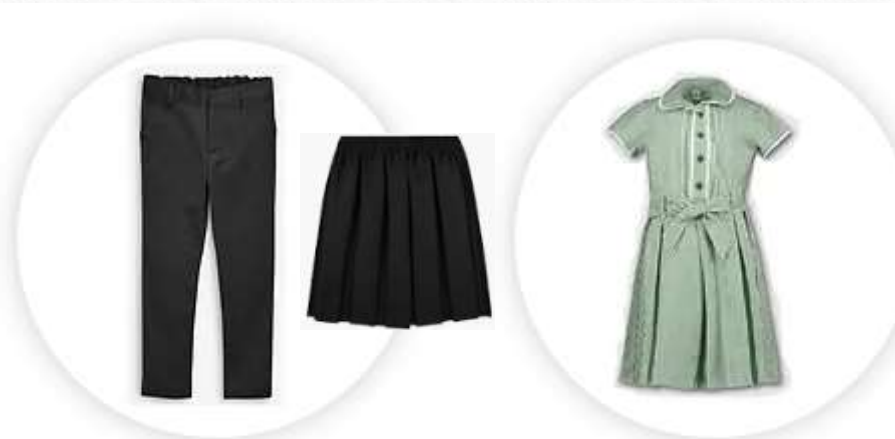
Grey or black trousers or shorts