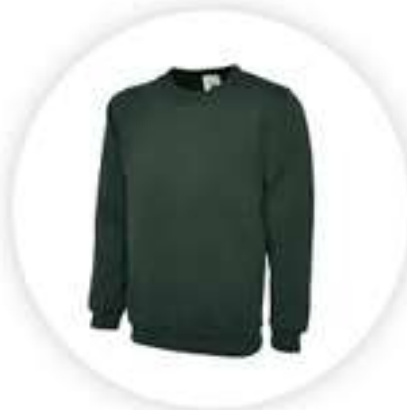
Bottle green sweatshirt